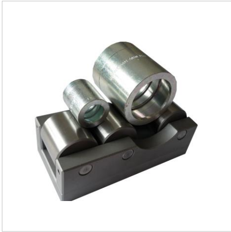
Work piece-specific devices