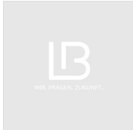
Work piece counter