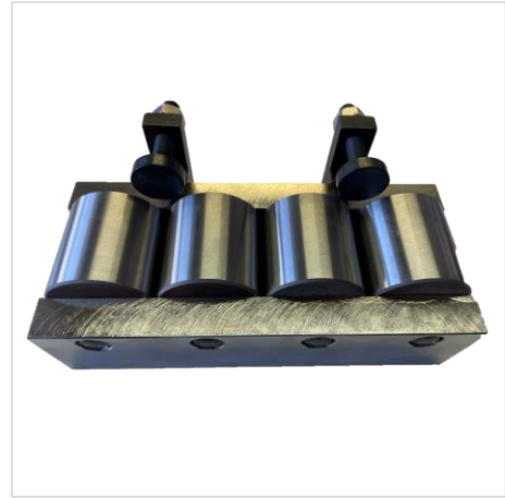
Double roller device