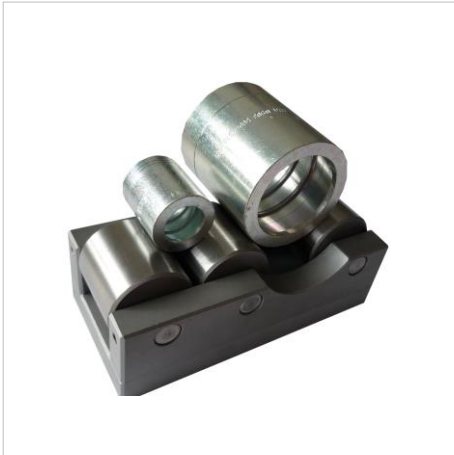
Work piece-specific devices