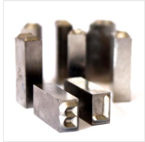
Standard steel types