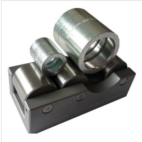
Work piece-specific devices