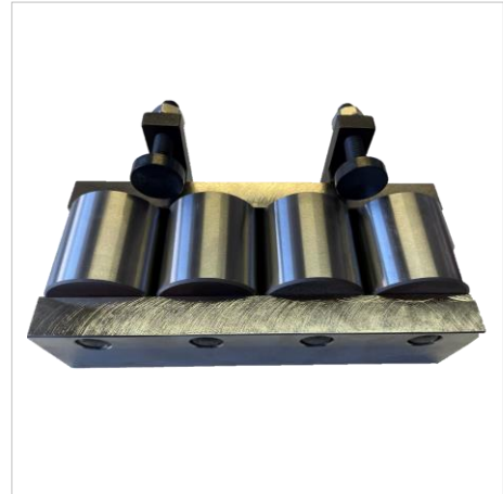
Double roller device