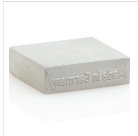
Engraved types, stamps