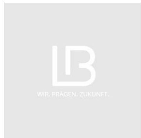
Work piece-specific devices