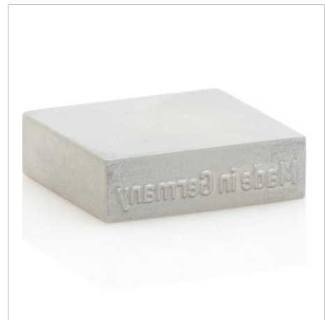
Engraved types, stamps