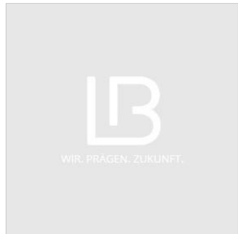
Clamping plates for tags