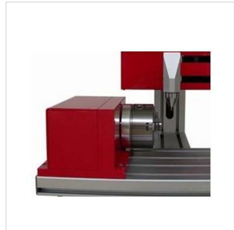
Circumference marking device