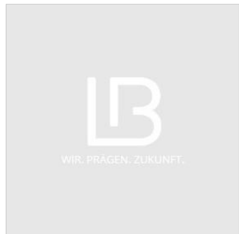
Touch-Display TC 100