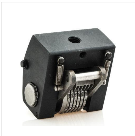
Version without indexing mechanism