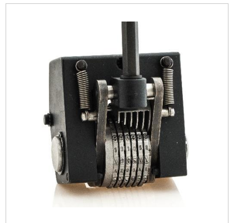
Version with indexing mechanism