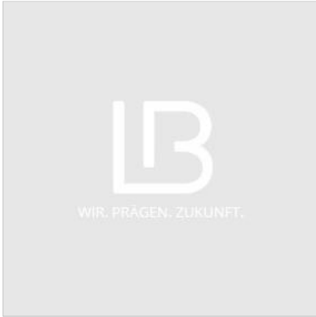
Work piece-specific devices