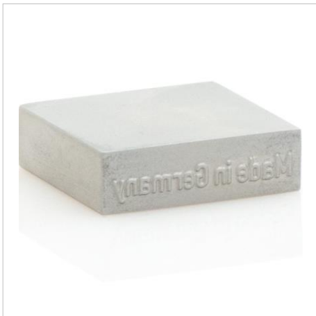
Engraved types, stamps